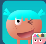
Thinkrolls 2: Logic Puzzles