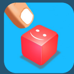
Blox 3D Junior

The apps, storybooks, and videos within this pack include: