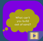
What Can't Be Built with Sand?