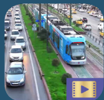
Solutions to Corrosion