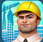
Tap Tap Builder