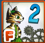
Pettson's Inventions 2