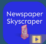
Make It: Newspaper Skyscraper