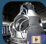
Flying High with a Balloon