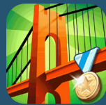
Bridge Constructor Playground