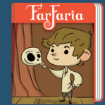
Little Billy Shakespeare