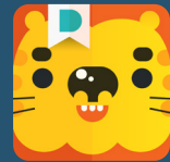
Duckie Deck Collection