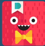
Duckie Deck Monster