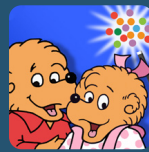
Berenstain Bears in the Dark