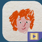
Art-Inspired Stories: Meet Me