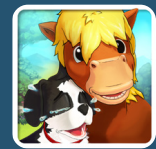
Peppy Pals Farm