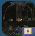
Afraid of the Dark