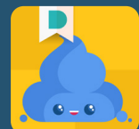
Duckie Deck Gotta Go