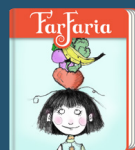
Broccoli Is for Me