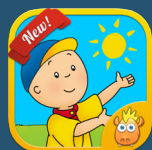
A Day with Caillou

The apps, storybooks, and videos within this pack include: