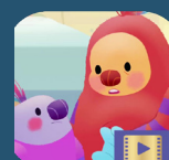
How to Wash Your Hands