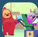
Foods of the Rainbow