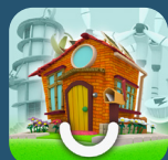
My Green City