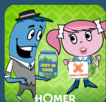
Earn, Save, Spend & Donate