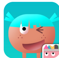
Thinkrolls 2: Logic Puzzles