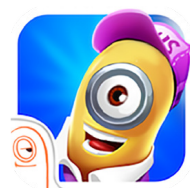
Mini Bean Adventures