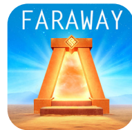
Faraway Escape Puzzle