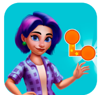
Connectify: Color Puzzle

This pre-loaded tablet includes the following apps: