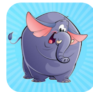
How Do You Know?