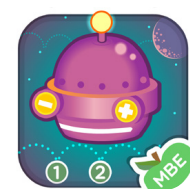
Robo Math Number Line Galaxy

Kids will practice their math skills with engaging activities, eBooks, and games as they learn basic equations, addition and subtraction, practice counting, and more!