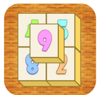
Mahjong Mystery Numbers