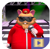
Addition & Subtraction Rap

This pre-loaded tablet includes the following apps: