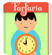
I Can Tell Time