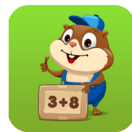
Kids Kindergarten Math