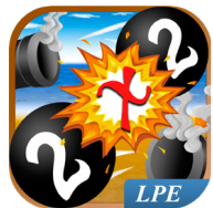
2 x 2 = 4: Fun Times Tables

This pre-loaded tablet includes the following apps: