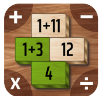
Math Facts Mahjong