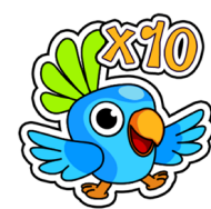
The Parrots Multiplication Game

Kids will practice their math skills with these engaging activities and games as they learn basic equations, practice pattern recognition, and more!