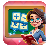
IQ Math Challenge