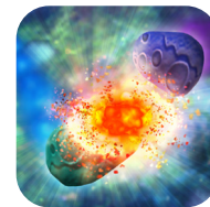
Math Blaster Space Zapper