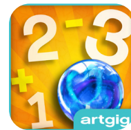
Marble Math Junior