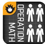
Operation Math Code Squad