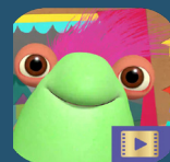
Marvie Makes a Modern Fairytale