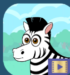
ABC Phonics Song