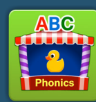
Kids ABC Phonics