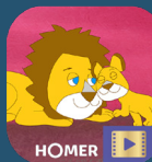
Power Word: Dad