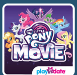
My Little Pony: The Movie