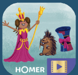
Meet the Letter Q