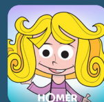
Goldilocks & the Three Bears