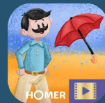
Meet the Letter U