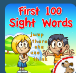
First 100 Sight Words