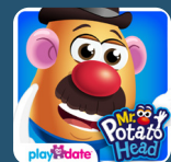
Mr. Potato Head: School Rush