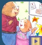
When I Feel Good about Myself