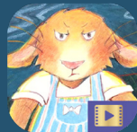
When I Feel Angry