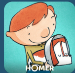
Aggie the Brave: Get Well Soon

The apps, storybooks, and videos within this pack include: