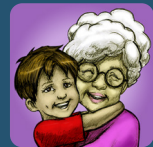
Trip to the Nursing Home