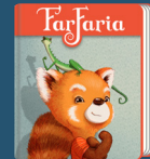
Milo and Izzy: I Can Be