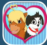
Peppy Pals Sammy Helps Out