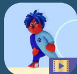
If You're Happy and You Know It