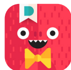
Duckie Deck Monster