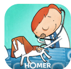
Aggie the Brave: A Visit to the Vet