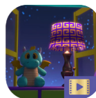
I'm Not Afraid of the Dark