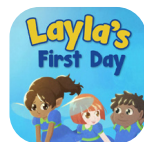
Layla's First Day