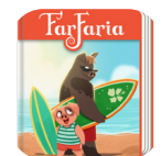
Surf's Up, Pork Chop