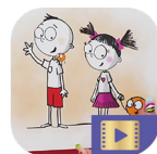
A Little Spot of Confidence