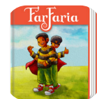
Adventures of Bully Bee Gone

Social & Emotional Learning SuperPack - Ages 5+