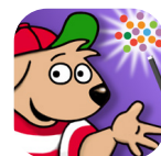
Harry and the Haunted House