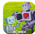
Robot's First Day of School