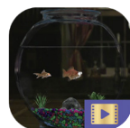
Afraid of the Dark