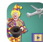
How Do People Get Phobias?