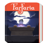
Zombie Elementary: Stage Fright

This pack includes interactive stories and activities that allow kids to develop social and emotional skills by building confidence, overcoming fears, increasing self-esteem, and more.