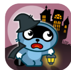
Pango Halloween Memory