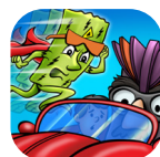
Strangers: The Ku Kidnapping