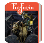
The Legend of Sleepy Hollow