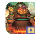
Skeleton for Dinner