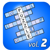
Astraware Acrostic, Volume 2

This pre-loaded tablet includes the following apps: