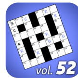
Astraware Codewords, Volume 52