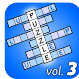
Astraware Acrostic, Volume 3