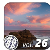
Astraware Sudoku, Volume 26