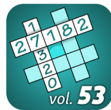
Astraware Number Cross, Volume 53