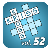
Astraware Kriss Kross, Volume 52