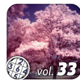
Astraware Sudoku, Volume 33

In a world of letters and numbers, everything has its place. Can you figure it out? Brain Games help train your mind by challenging memory, reaction time, problem-solving and observation skills, attention span and more!