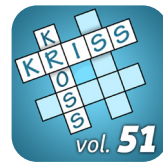
Astraware Kriss Kross, Volume 51