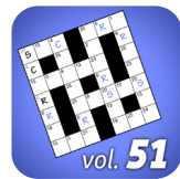
Astraware Codewords, Volume 51