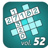
Astraware Number Cross, Volume 52