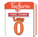
Vowel Sounds: Long O