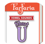
Vowel Sounds: Short U