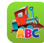
Kids ABC Trains