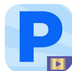
What Does the P Say?

Stay sharp all summer long through interactive activities, storybooks, and games that will develop basic reading skills, teach phonics, improve logic and critical thinking, build fundamental math skills, and much more!