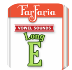
Vowel Sounds: Long E