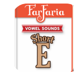
Vowel Sounds: Short E