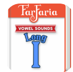
Vowel Sounds: Long I