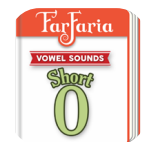
Vowel Sounds: Short O