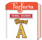
Vowel Sounds: Short A