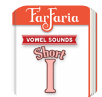
Vowel Sounds: Short I