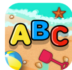
Choo Choo ABC