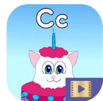
ABC Phonics Song