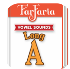
Vowel Sounds: Long A