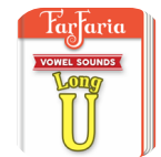
Vowel Sounds: Long U