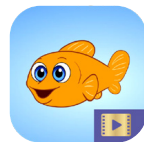
Animals ABC Phonics Song