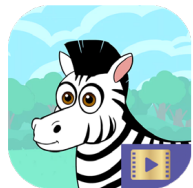
ABC Phonics Song

This pre-loaded tablet includes the following apps: