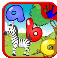
ABC Sight Word Jigsaw Puzzle