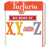
Big Book of X, Y, and Z