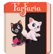
Sight Words: Opposites