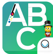
Agnitus Preschool Reading & Writing