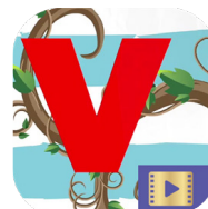
What Does the V Say?

Stay sharp all summer long through interactive activities, storybooks, and games that will developing basic reading skills, teach phonics, improve logic and critical thinking, build fundamental math skills, and much more!