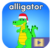
Christmas ABC Phonics Song